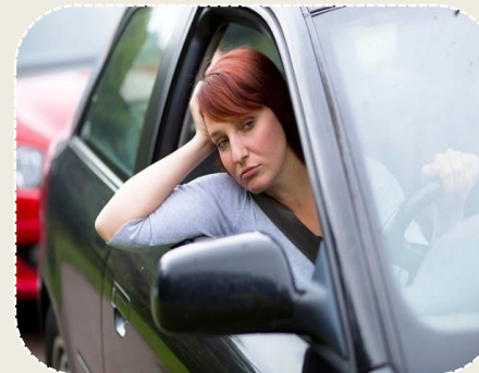
Quality of Life