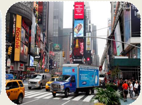
Ability for Businesses to Thrive