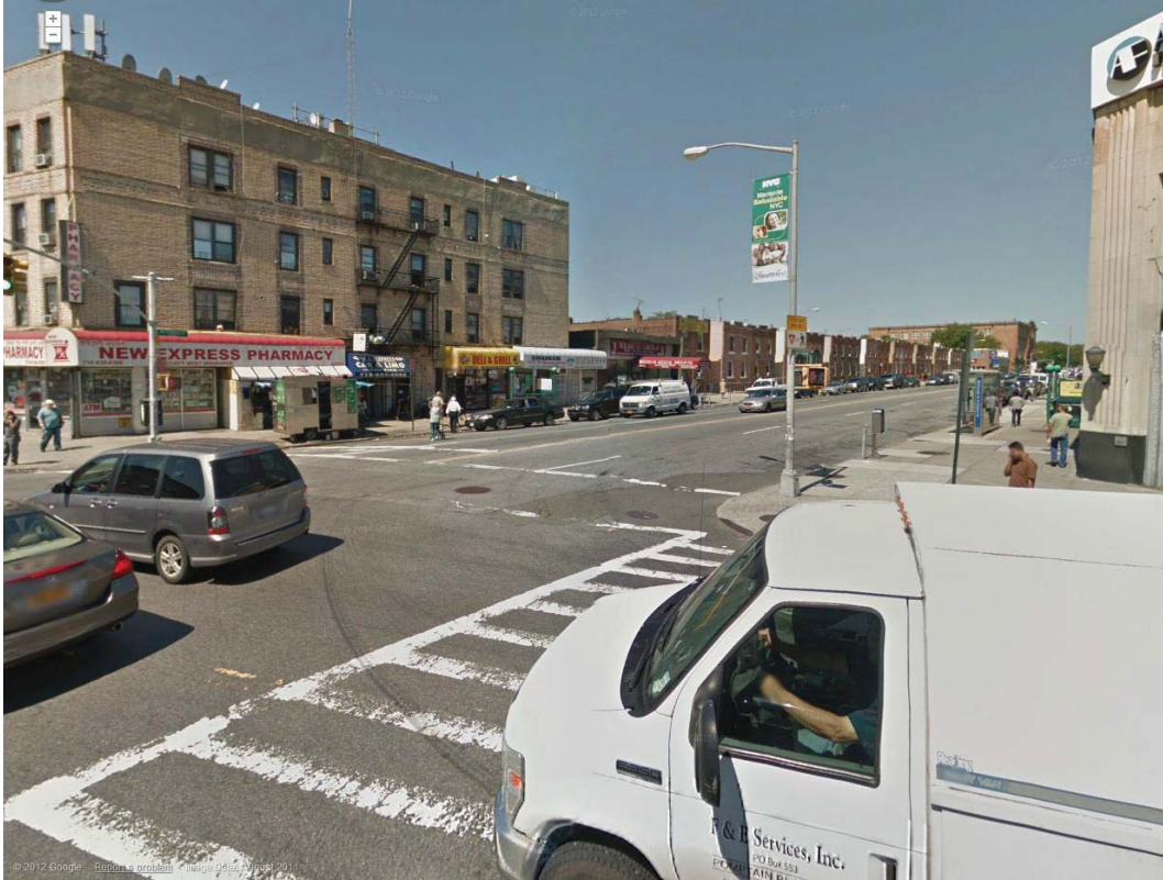
Existing Conditions: Church Avenue and McDonald Avenue