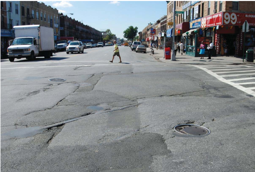
Existing Conditions: Church Avenue and McDonald Avenue